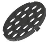
Deep cylinder anti-glare shield